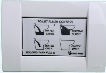
Smart Toilet Control STC