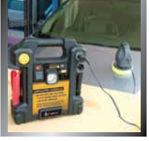
12V DC OUTPUT