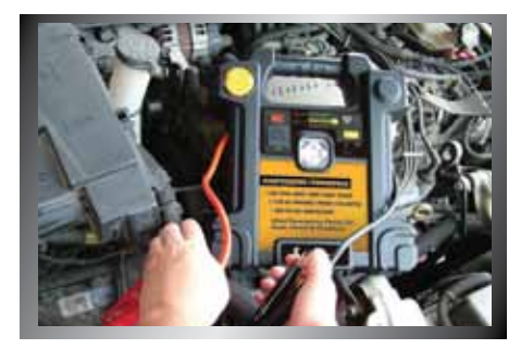
500 PEAK AMPS BOOST CAPABILITY TO START CAR ENGINE