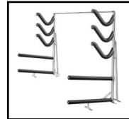
Base Rack Assembly With combination of optional arms