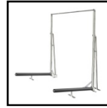
R10-1001 Base Rack Assembly