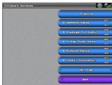
List of Marine Service Items