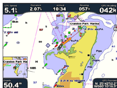
Go to Destination