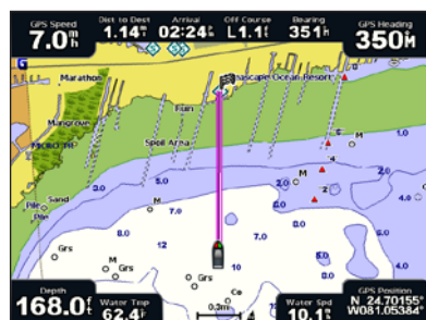
Go to Destination