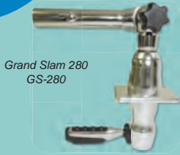
Grand Slam 280 GS-280