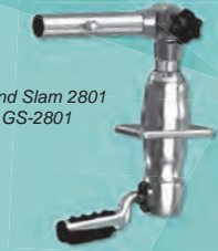
Grand Slam 2801 GS-2801