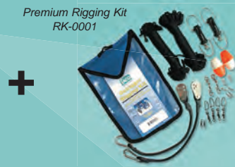
Premium Rigging Kit RK-0001